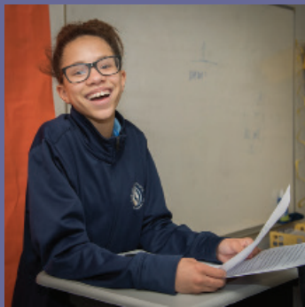
OSS Class of 2017 student

“The long days helped me get ready for Andover...so much hands-on attention and adult mentors looking out for you and helping you along the way.”