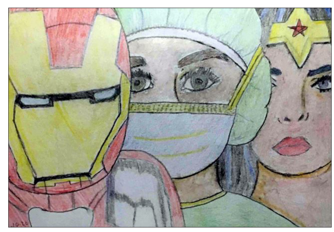
The Real Superheros by London '20